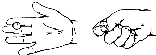
How to hold the shooter